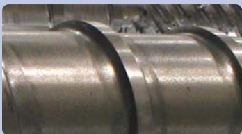
Standard Surface Finish: (60 Ra)