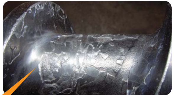
▲ Typical poor adhesion and chipping of competitive carbide coatings Xaloy's X8000™ has a metallurgical bond exhibiting no chipping ▼