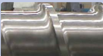
Polished Surface Finish: (16-32 Ra)

X8000™ is a thermal spray coating applied to the screw. This material complements Xaloy's high abrasive resistant X830 overlay and is well suited for processing highly filled or corrosive resins. It can be applied for the full flight length or only on isolated areas of the screw that are more susceptible to wear.