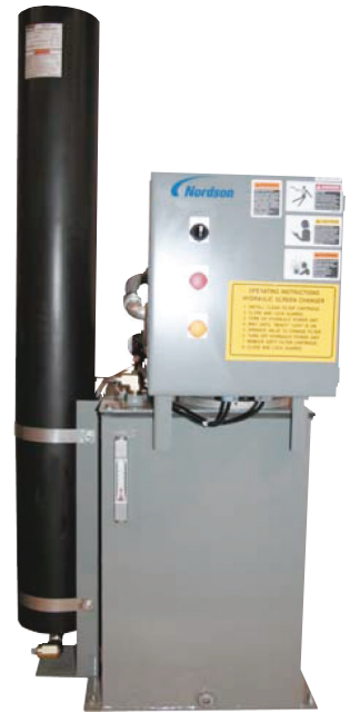
Hydraulic Power Unit

Nordson PPS GmbH Coermühle 1 48157 Münster / Germany +49.251.21405.0 Phone